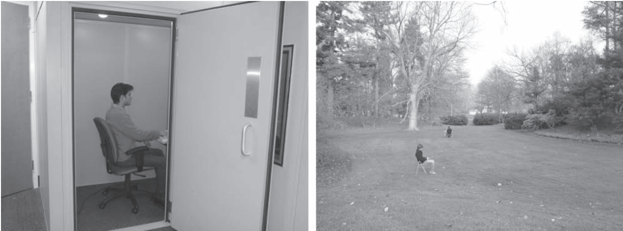
Fig. 1. Location of priming in Study 1. Participants completed the priming task either in an enclosed booth with the door closed (left panel) or in an open field (right panel; experimenter in foreground, participant in background).

Cesario, 2010) and gave participants the feeling of openness. Procedures were identical at both locations. After providing informed consent, participants began the computerized priming task.