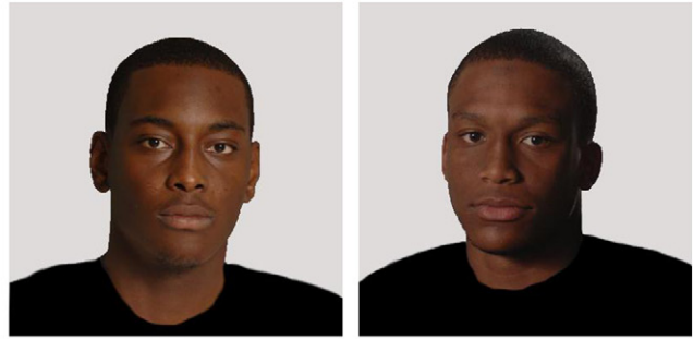
Dark-skinned/Less prototypical facial features (DL)