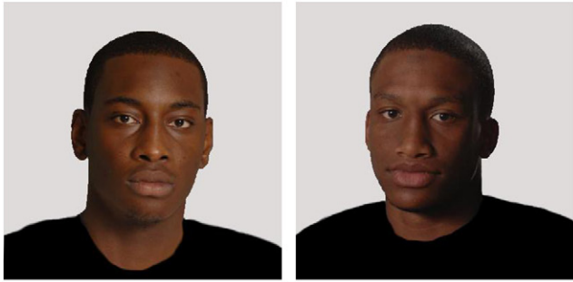
Dark-skinned/More prototypical facial features (DM)